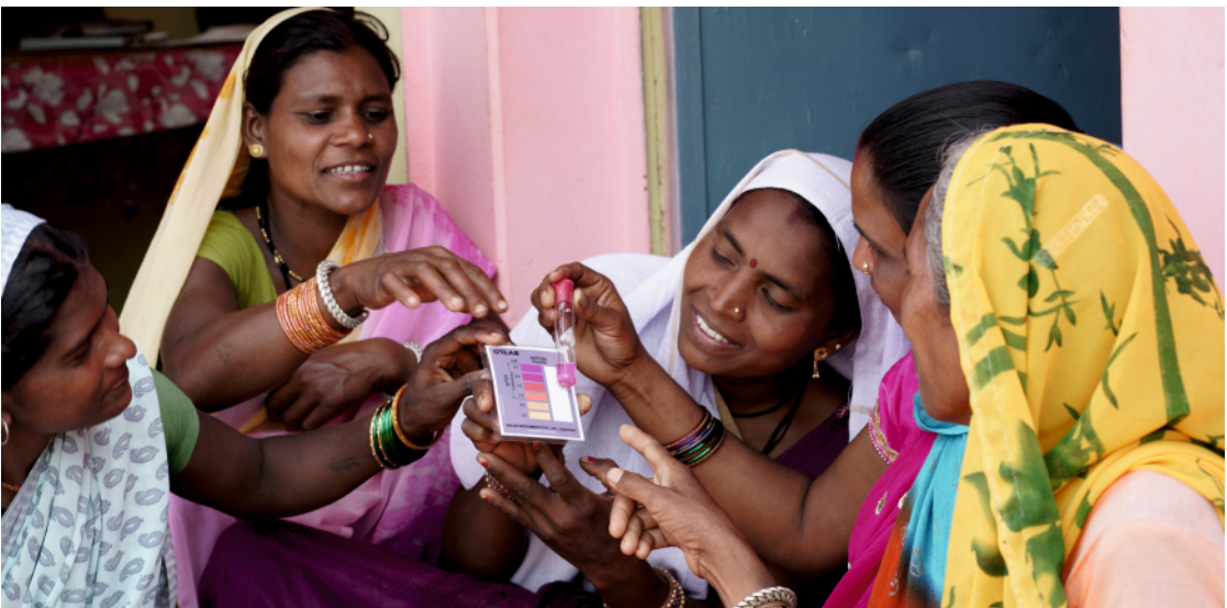
Women testing water quality using Field Test Kit (FTK)

9.5 The 15th Finance Commission in Chapter 7 of its Final Report for the period 2021-22 to 2025-26 has inter alia recommended tied grants for supporting and strengthening the delivery of basic services which are national priorities like Drinking water for all, sanitation, etc. The Government of India has also launched some schemes aimed at similar outcomes like Swachh Bharat Mission Grameen (SBM-G), Jal Jeevan Mission, etc. In order to sustain the achievements