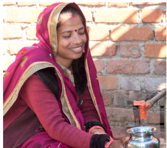
Woman with her household tap water connection

1.3. The 73rd Constitutional Amendment Act of 1992 added Part IX to the Constitution of India, i.e., 'The Panchayats' and also added the 'Eleventh Schedule', the latter consists of 29 subjects wherein the Panchayats are given administrative control. This was one of the important steps in strengthening the local self-governments and developing a 'responsible and responsive' leadership at village level. Under the 'Eleventh Schedule', two important subjects are 'drinking water' and 'health and sanitation, including hospitals, primary health centres and dispensaries'. To support