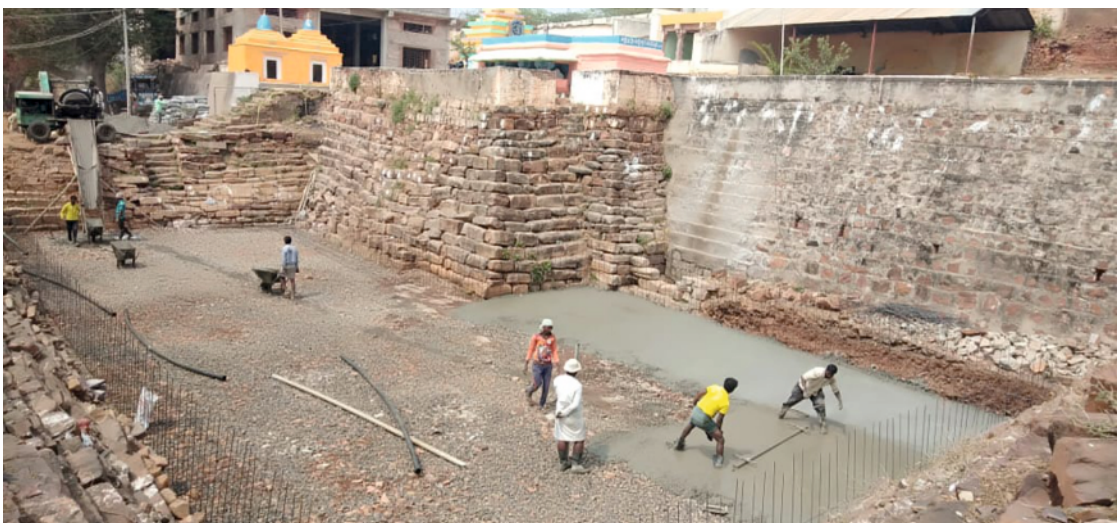
Local community rejuvenating step well