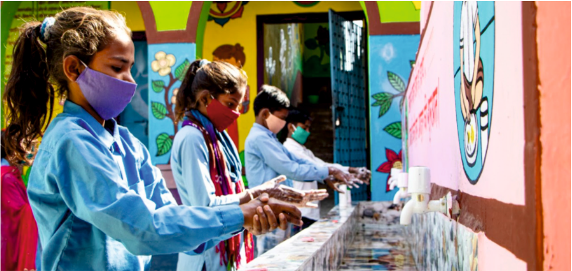
Students practicing handwashing in a rural school