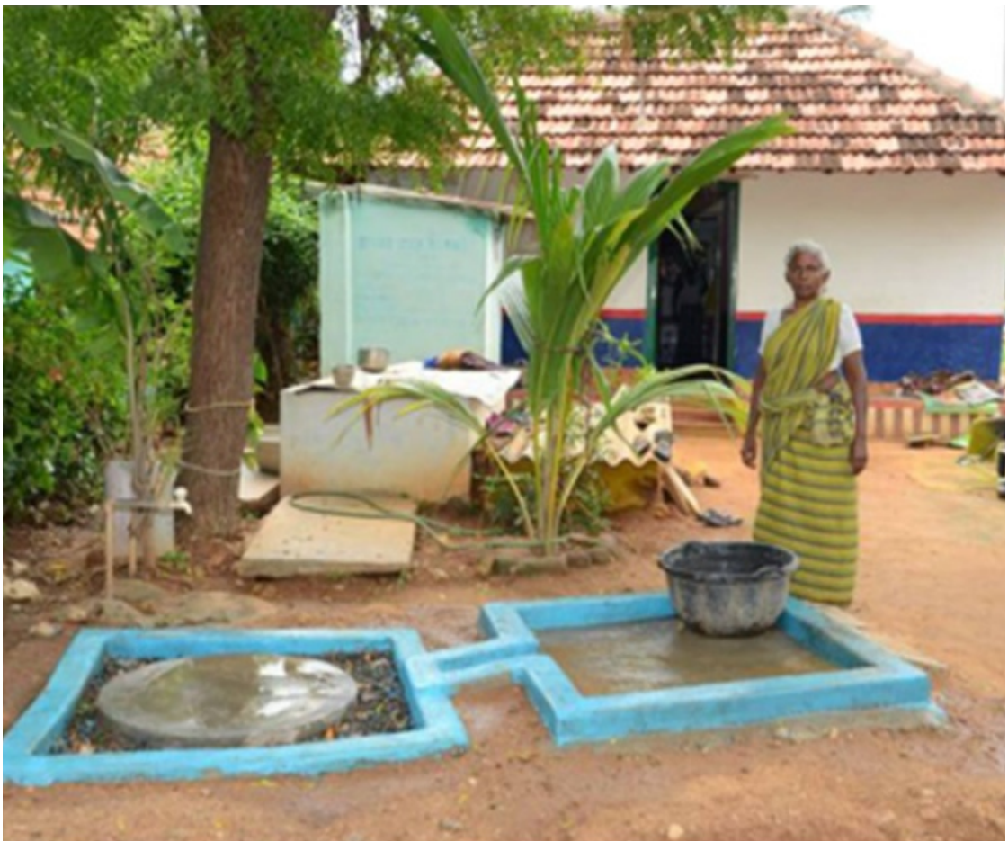
Soak pit for Greywater Management, Tamil Nadu