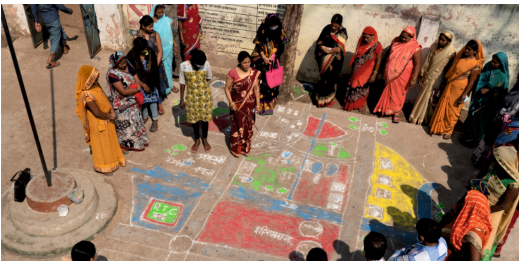
Water resource mapping in a rural village

7.1. Effective from the financial year 2021-22, the Panchayats/ traditional bodies are required to maintain their account transactions using the 15 th Finance Commission tied grant in eGramSwaraj, and make all vendor/service provider payments through the eGramSwaraj-PFMS interface only. The auditing of the annual accounts is also to be mandatorily carried out on the 'Audit online' application of MoPR. From 2023-