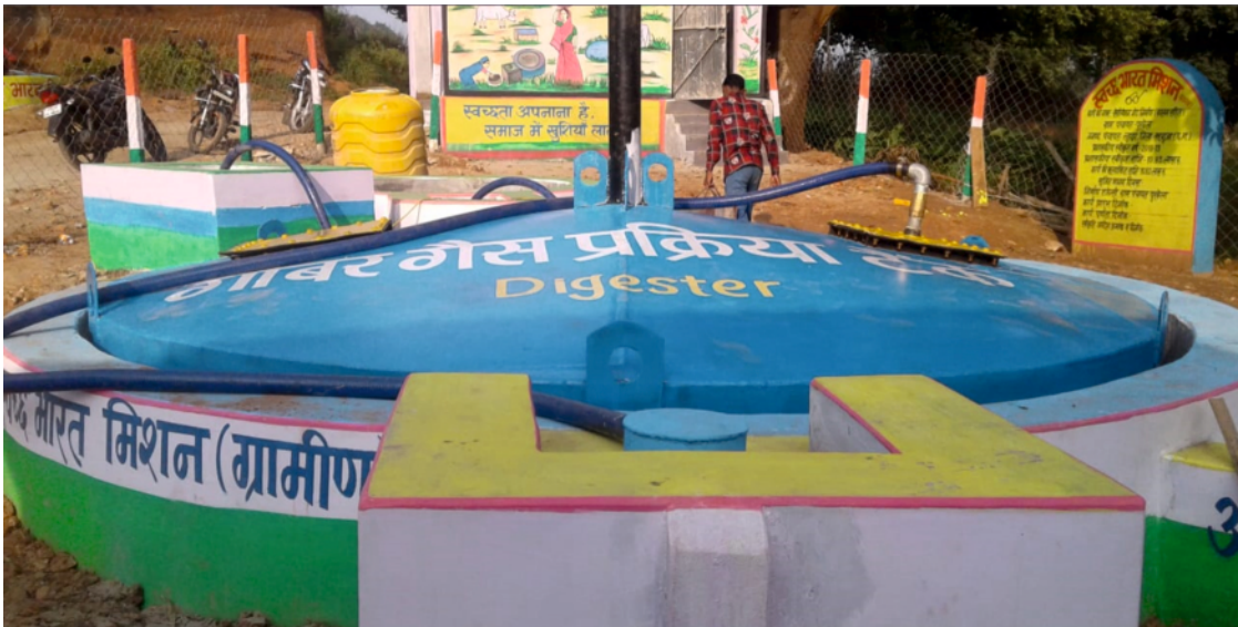
Bio-digester under GOBARDHAN scheme