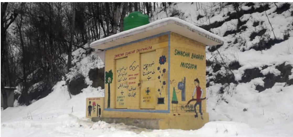
No one left out: Toilet in remote area of Jammu & Kashmir